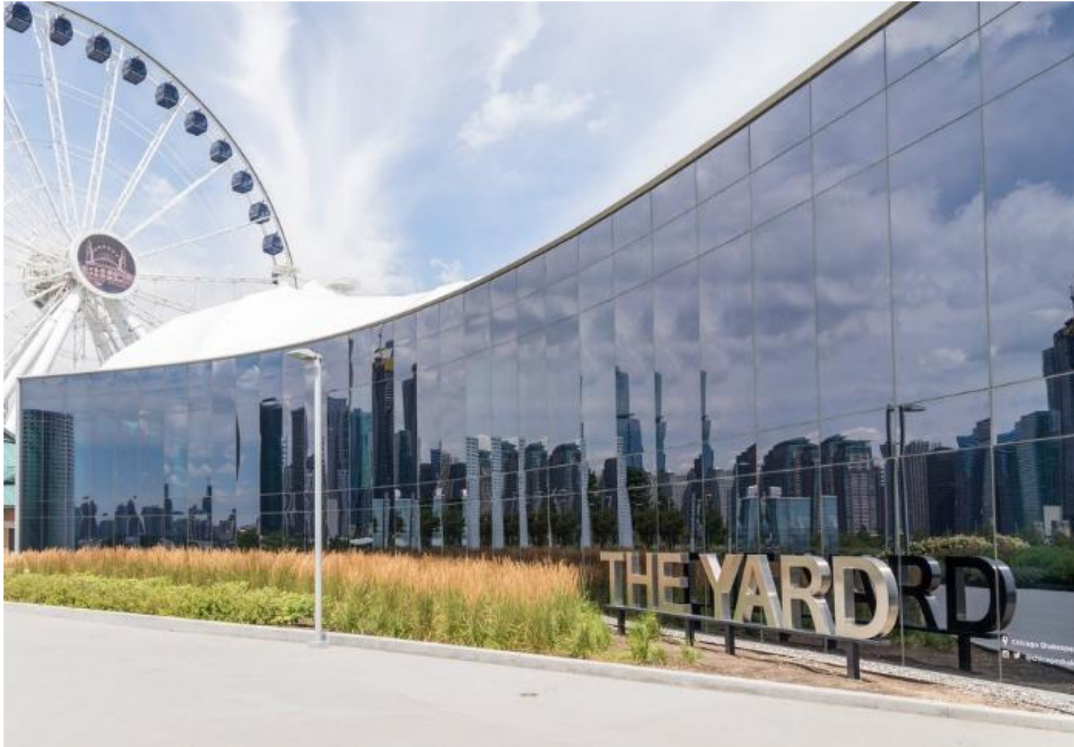
SageGlass: The Yard at Shakespeare Theater