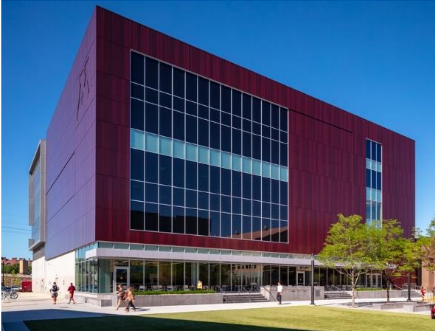
SageGlass: University of Minnesota Athletes Village