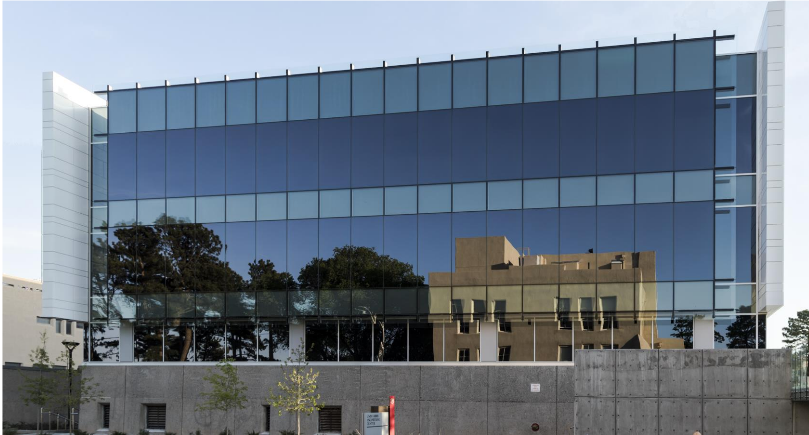
SageGlass: Farris Engineering Center